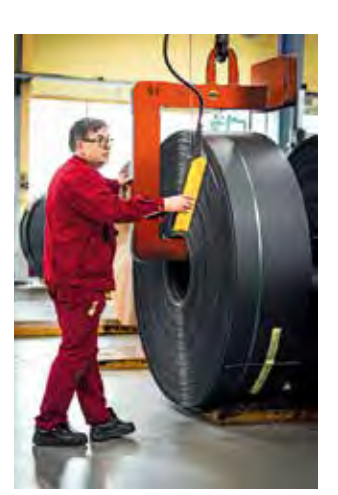
It's all in the coating: the coated material is unloaded.

The HÜHOCO group finishes metal surfaces that are used as headlight reflectors to ensure good visibility.