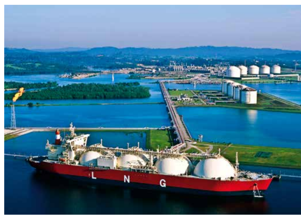
LNG tanker with spherical tanks: Natural gas can be transported by ship in its liquid state.

Now that its 9% nickel steel has been approved, steel is now certified with two more important classification organizations.